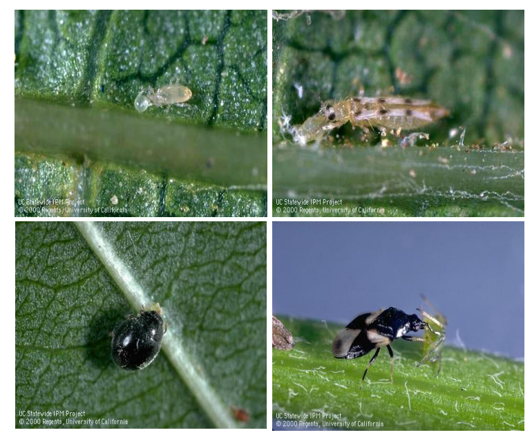
Figure 2. Spider mite natural enemies common in walnuts: western predatory mites (top left), sixspotted thrip (top right), spider mite destroyer (bottom left) and minute pirate bug (bottom right)