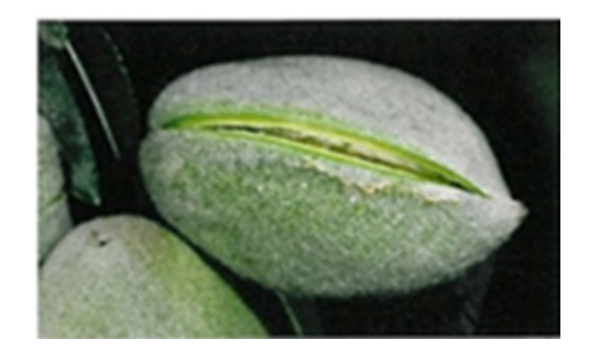
Stage 2C of hull split. This is the critical time for NOW insecticide and Rhizopus hull rot fungicide applications. The orchard is ready for harvest when all nuts are at Stage 2C.

using this practice in already water stressed trees may lead to a yield reduction.