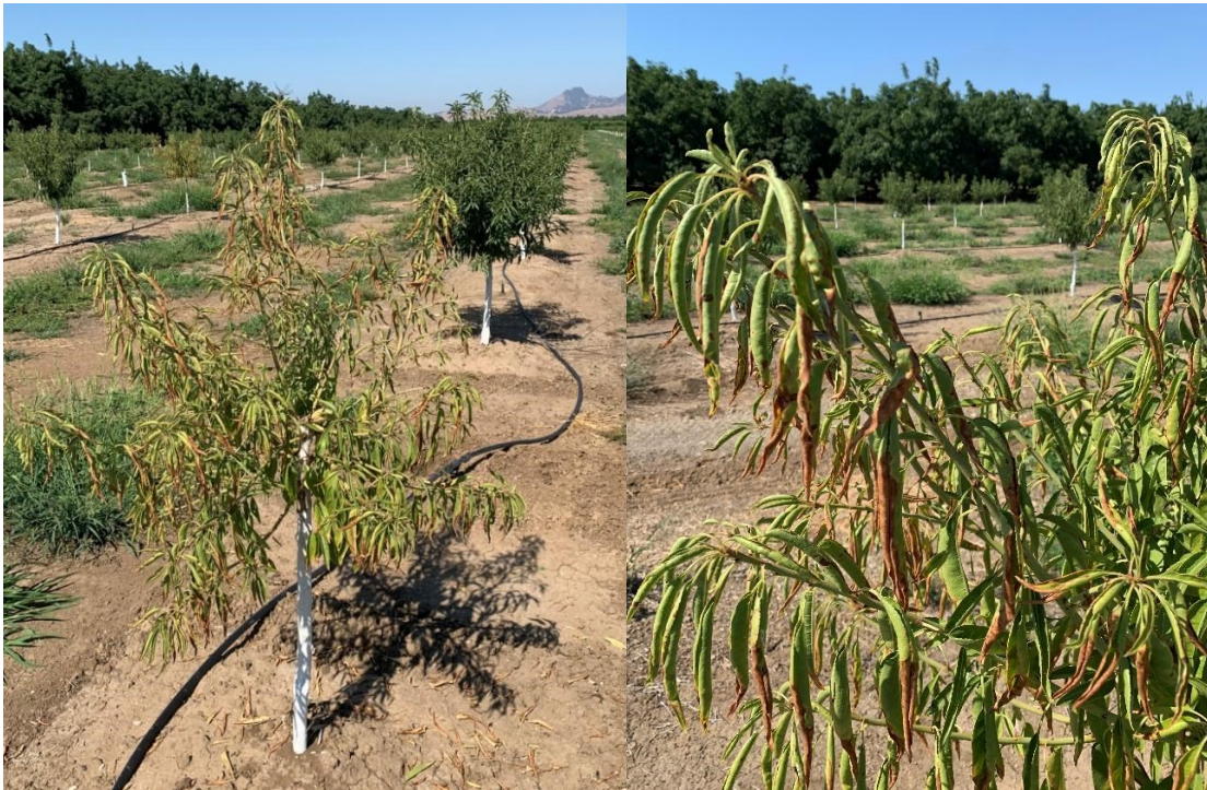
Figure 2. Low vigor and yellow curled leaf (YCL) symptoms on 2 nd leaf Independence® on Krymsk® 86 rootstock. Photos taken July 2, 2021.

Stay tuned for developments at the UC Butte County almond variety trials (all varieties on Krymsk® 86 rootstock, planted at the CSU Chico University Farm) to help inform your decisions about new almond varieties.