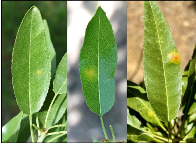
Figure 1. Early symptoms of red leaf blotch include small, pale yellowish spots or blotches that affect both sides of the leaves.

If you suspect that you have this new disease in your almond orchard, please contact your local UC Cooperative Extension farm advisor