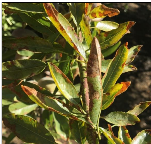
Photo 1. Leaf burn symptoms associated with very low potassium. Potassium leaf concentration in Sonoras was half of the K value in Nonpareil in the same orchard.

I had a number of farm calls this summer for leaf burn in almonds. It was often much worse in Monterey than the other varieties, and in fields with strong disease management programs. The culprit? Low potassium. It's an understandable problem to arise when input prices are high and almond prices are low. Gone are the days of throwing on a little extra just in case. Everyone is trying to find that sweet spot of delivering just enough inputs to maintain healthy trees and a good crop, and it's easy to miss that mark when margins are so thin.