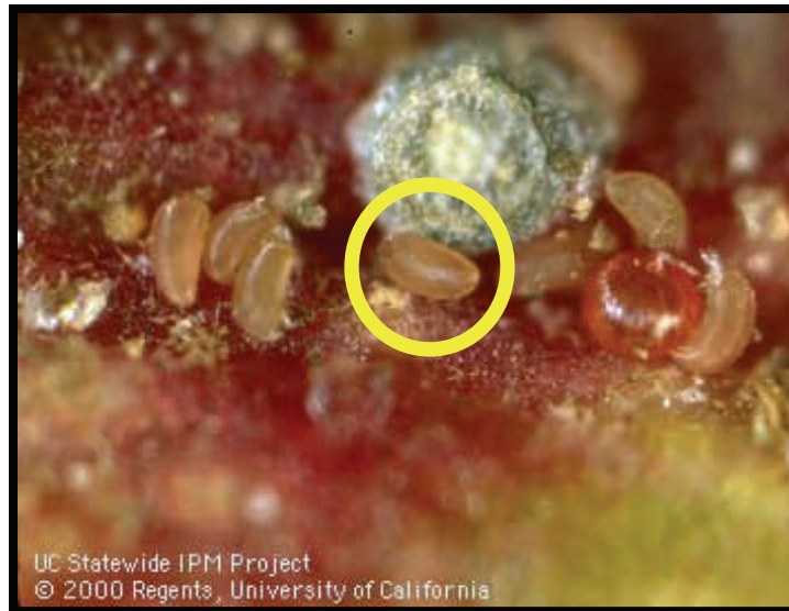
Big-beaked plum mites

So why talk about them? Under certain circumstances the damage can affect the growth habit of the tips of branches and reduce the growth of scaffolds and limbs on young trees. The goal for the first 1-3 years of an orchard's life is to grow the largest trees you can. All management is aimed at promoting growth so when you have a mite that restricts growth it becomes a problem. The eriophyid mite attacks the growing shoot tip, damages emerging leaves, and increases bud breakage at the growing tip creating a 'witch's broom effect' much like a peach twig borer strike but worse because it continues to feed on the newly emerging leaves. The mite feeding slows productive shoot growth on affected limbs for this season and will need to be pruned off during the next dormant season.