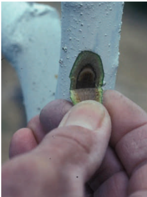
Figure 1. Walnut freeze damaged wood is discolored and dry. Photo, 4/94 by J. Hasey.

If you suspect cold damage, do NOT prune out the damaged limbs. Buds may be slow in opening or buds from deep in the bark may grow to rejuvenate the limb. In the late summer, prune out dead wood that did not revive. New scaffolds that grew can be trained to replace the damaged wood. Reduce or delay spring fertilizer applications where cold damage is evident.