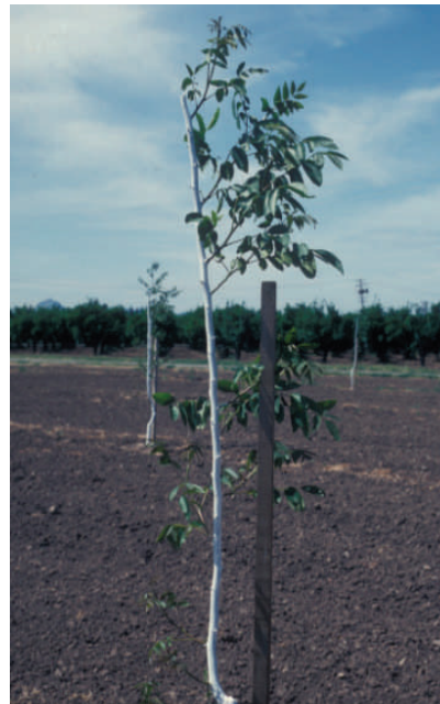
Figure 2. 1-year old Chandler painted white after December 1990 freeze. Damage (no upper shoots) on southwest side of tree. Photo, 5/91 by J. Hasey.