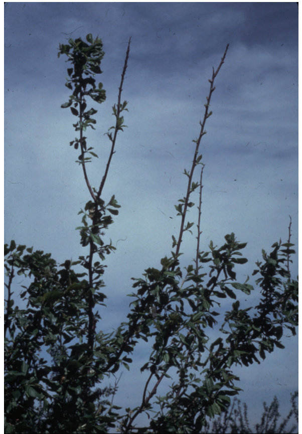
Zinc Deficiency symptoms in French Prune