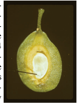
Figure 1. Extracting endosperm at reference date.

Removing some of the fruit early in the season will allow the remaining fruit to grow larger and develop a higher sugar content and improved drying ratio. Mechanical thinning with the same machinery used for harvest is the most practical way of accomplishing this. A representative sample taken at reference date, when the endosperm is visible at the flower end of the fruit (Fig. 1), usually in early May, will allow for an estimation of fruit size at harvest (Table 1). Unfortunately, this procedure will often overestimate size, especially with a heavy crop load. To get a better idea, using your experience and past production history, estimate the tonnage you can produce at the desired size and determine how many fruit per tree at harvest will result in this yield. For example, 4 tons (8000 lbs) X 70 dry fruit per pound divided by 151 trees per acre (in a 18' x 16' planting) = 3708 fruit/tree at harvest. Adjust this by the estimated pre harvest drop to determine how many fruit should be left after thinning. Work done in the Sutter-Yuba area in the 70's suggested that approximately 40% of the fruit would drop between reference date and harvest. More recent work in Glenn and Tehama Counties has suggested that fruit drop may be closer to 20%. Using 20% drop in our example, 308 divided by .8 = 4635 fruit left per tree after shaking.