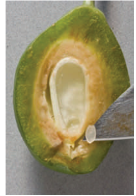
Figure 1. Extracting endosperm at reference date.

By dividing the estimated fruit number at harvest by the estimated or desired dry count per pound and then multiplying by the number of trees per acre, you can estimate the dry pounds per acre. This number will allow you to judge if your estimated fruit size at harvest (from Table 1) is realistic, based on comparisons with crop history – size and yield – from that orchard. You can then determine how many fruit of the desired dry size are necessary to give the expected dry yield and adjust the number upward by 20% to allow for drop. Now compare the two sets of numbers. If the number of fruit per tree measured in your orchard matches the number of fruit per tree at harvest needed to produce a certain size and tonnage of fruit (plus added 20% to account for drop), then you don't need to thin. If the number of fruit measured in your orchard far exceeds the needed number of fruit at harvest (+20% for drop) then you should thin. For example, if your orchard trees should carry 5000 fruit to produce a solid crop in your orchard (for example, 3 dry tons of 60 count fruit) and your trees have 10,000 fruit/tree at reference date – regardless of what Table 1 predicts -- you should consider thinning.