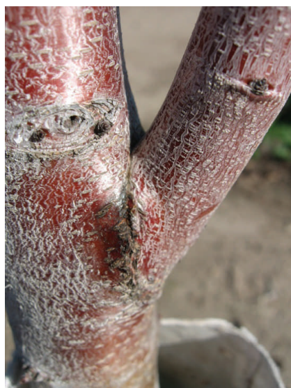
Figure 1. A weak primary scaffold with included bark (left) that is likely to split out.

Twenty years ago many young orchards were pruned way more severely than necessary or desirable. Today, I believe that too often, little to no training is practiced with the mistaken assumption that yield will be the best with no downside. That is not the case. Good intermediate pruning will minimize blow overs while still returning reasonable early production and longer term tree health.