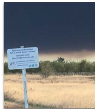
Smoke fills the air in the Sacramento Valley during the Camp Fire- Nov 2018