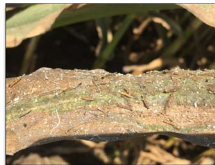
A corn plant in Northern California, covered in ash from a wildfire

A subset of 37 samples were analyzed for toxicological compounds by gas and liquid chromatography–mass spectrometry organic chemical screens. These screens detect a large number of organic compounds belonging to diverse chemical classes, including pesticides, environmental contaminants, drugs and other natural products.